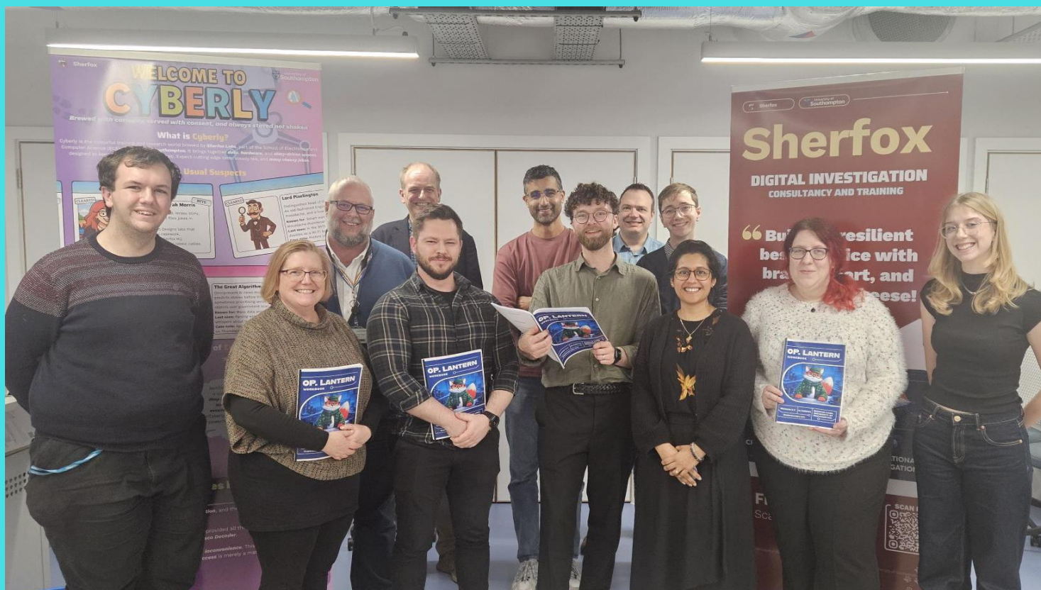
Inside X 2026 on Advanced Data Analytics for Digital Forensics – a collaborative event between ACE, Home Office, Southampton University and the FCN.